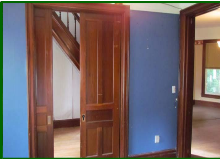
One of Several Pocket Doors

For Additional Information On This Property, Including Video Tour, Tax Map and Disclosures, Log Onto: