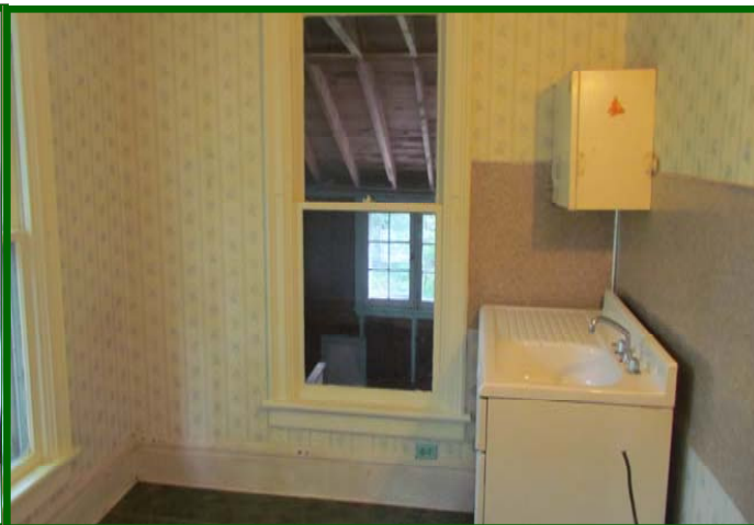
Possible 2nd Level Kitchen in Converted