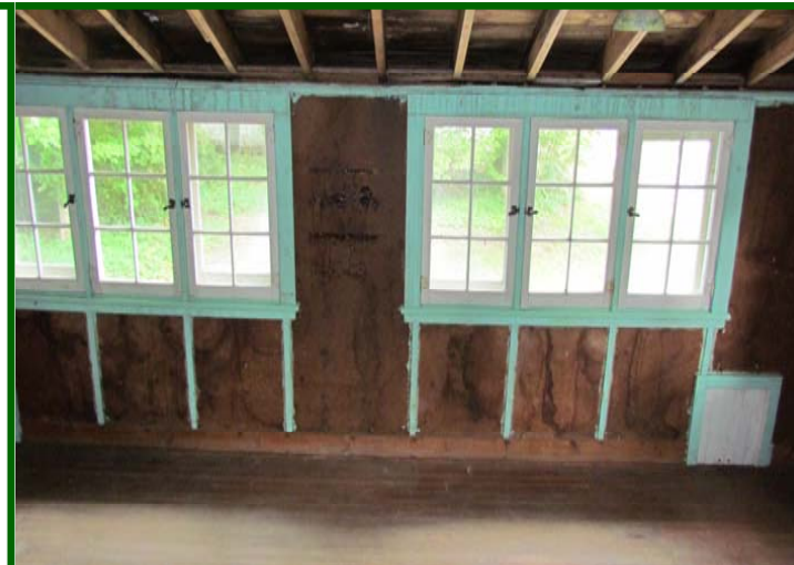
Sleeping Porch or Potential Living Space