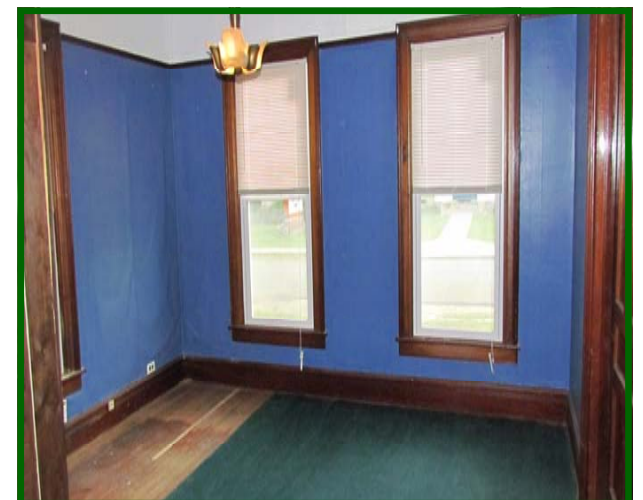
Dining Room with Pocket Doors