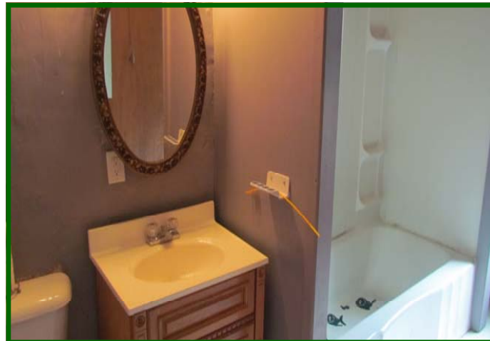
1 of 2 Baths