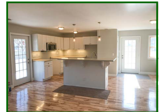
View of Living Room to Kitchen