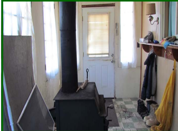
Enclosed Front Porch w/Wood Stove