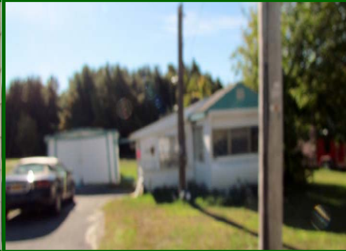
Single Wide—Rental Income $300/mo