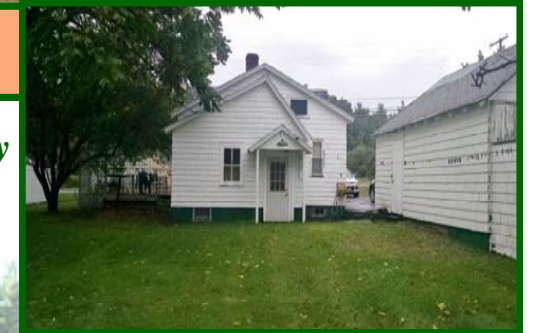
Rear View of Home

MLS# S1152514 29580-584 Maple Street Black River, NY 13612