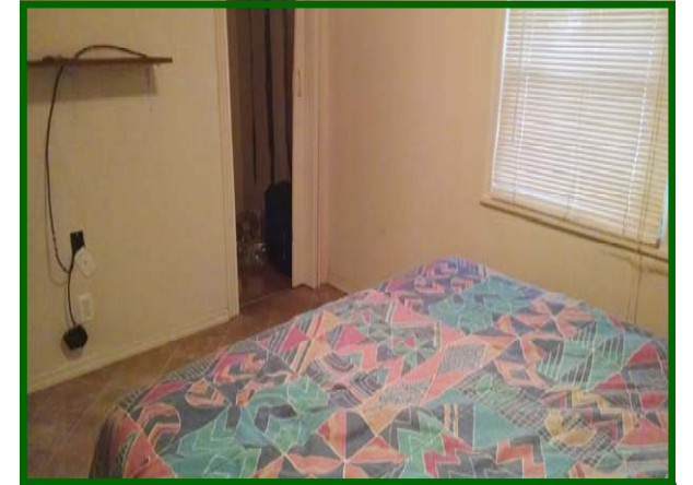
First Floor Bedroom