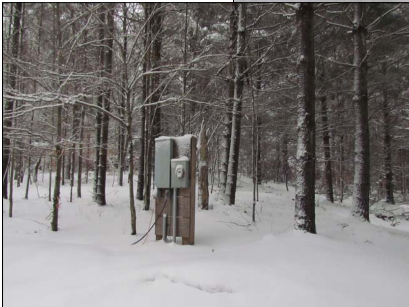
Electric Brought To Site