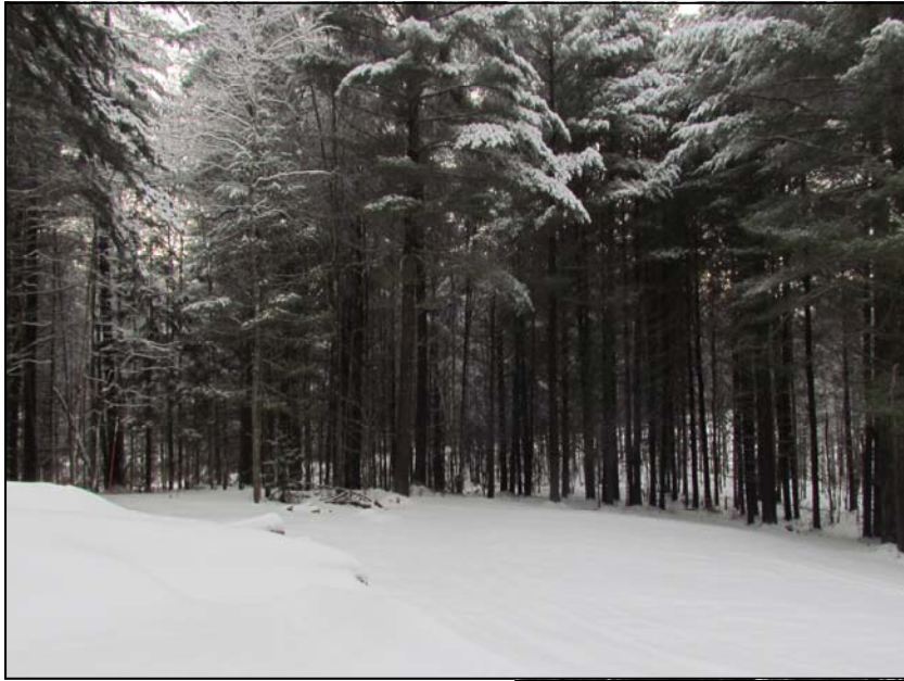
View of Land From Clearing