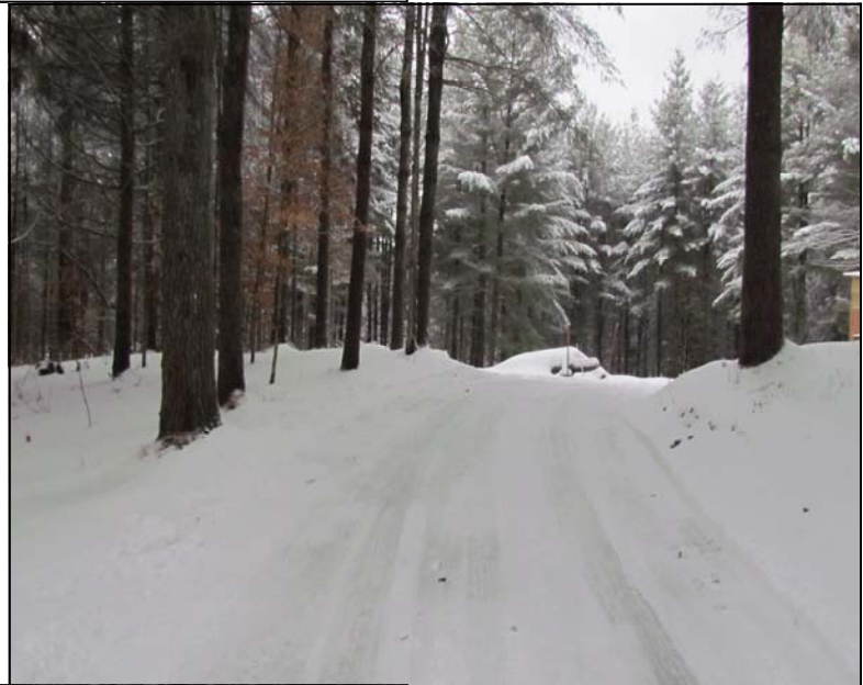
View from Pleasant Valley Rd Driveway