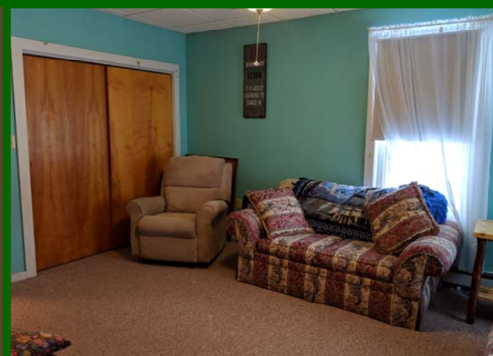
Opposite View of Double Living Room