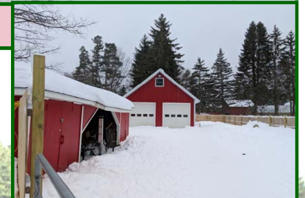
Back Yard w/24' x 24' Pole Barn & Separate Shed

MLS# S1171269 4171 State Route 26 Turin, NY 13473