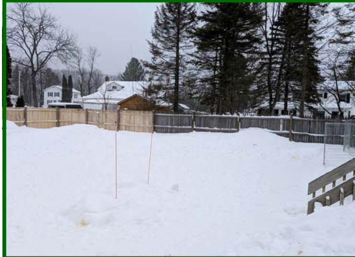
Fenced Back Yard