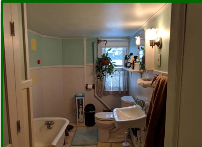
2nd Level Bathroom