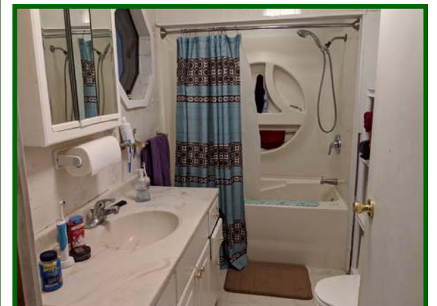
First Floor Bath

For Additional Information On This Property, Including Video Tour, Tax Map and Disclosures, Log Onto: