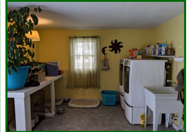
Mud Room/Laundry Room