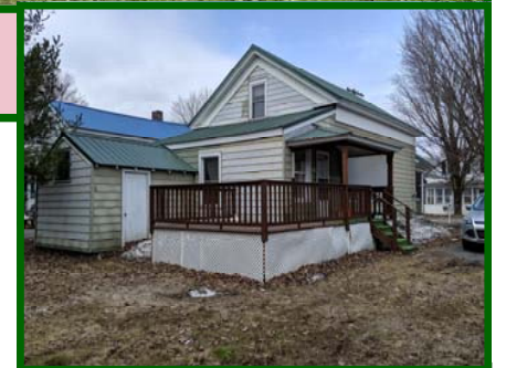
Rear View of Home

MLS# S1174330 204 Academy Street Boonville, NY 13309