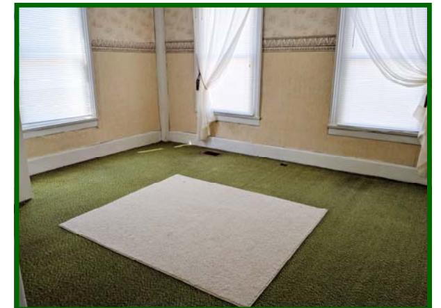
First Floor Bedroom