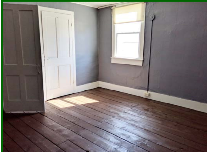
2nd Level Bedroom