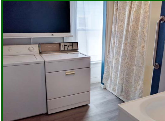
First Level Bathroom/Laundry