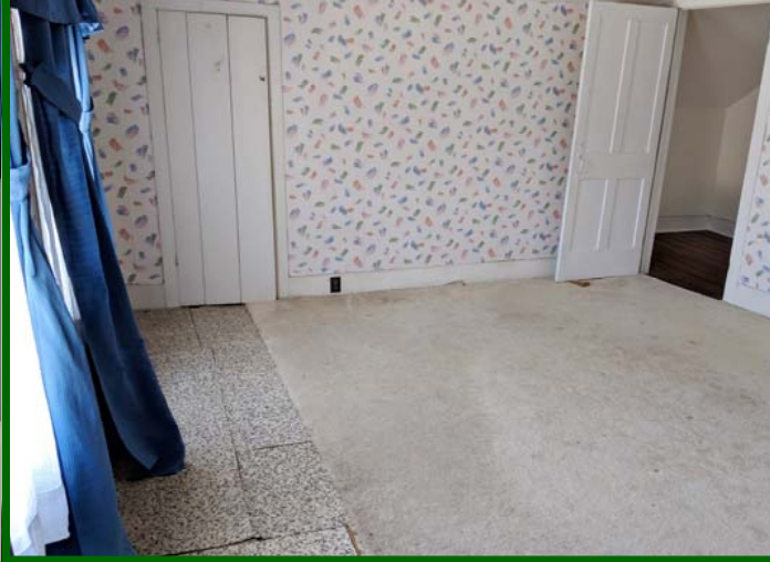
2nd Level Bedroom