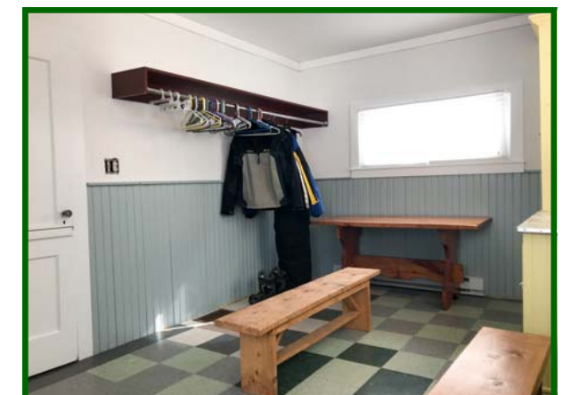
Large Mud Room