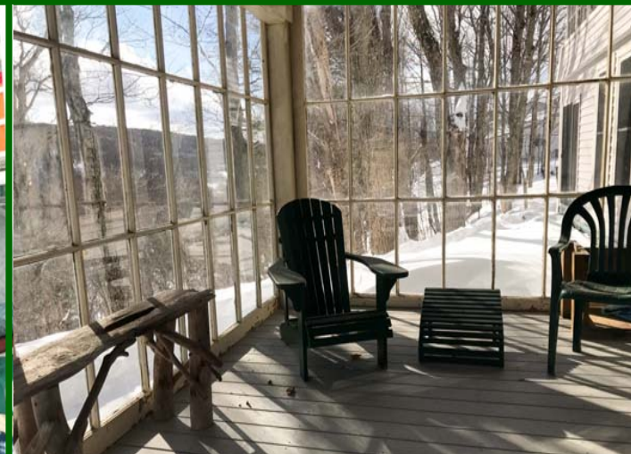
Enclosed Porch Overlooks Sugar River