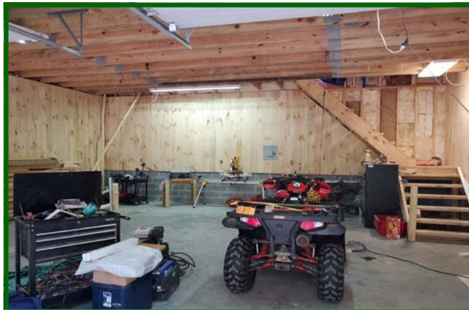
Hi Ceiling - Heated Garage – 4 Wheeler Included Ski Doo 585 and Polaris 800 Snowmobiles Included