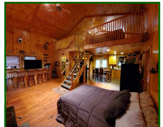
Most Contents to Stay