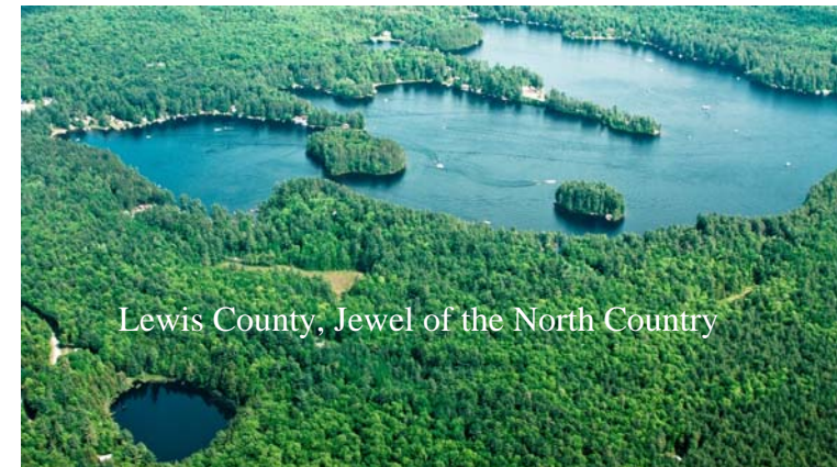
Lewis County, Jewel of the North Country

Adirondack Style Cabin Custom Workmanship. 5 Minute Walk to Otter Creek+/-