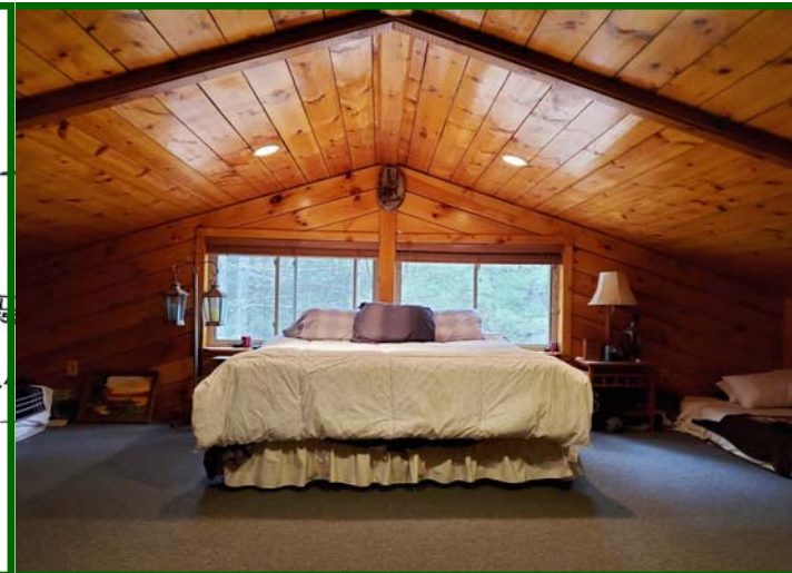
Great Room Over Garage