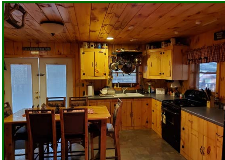
Kitchen Area – All appliances & kitchen contents incl.