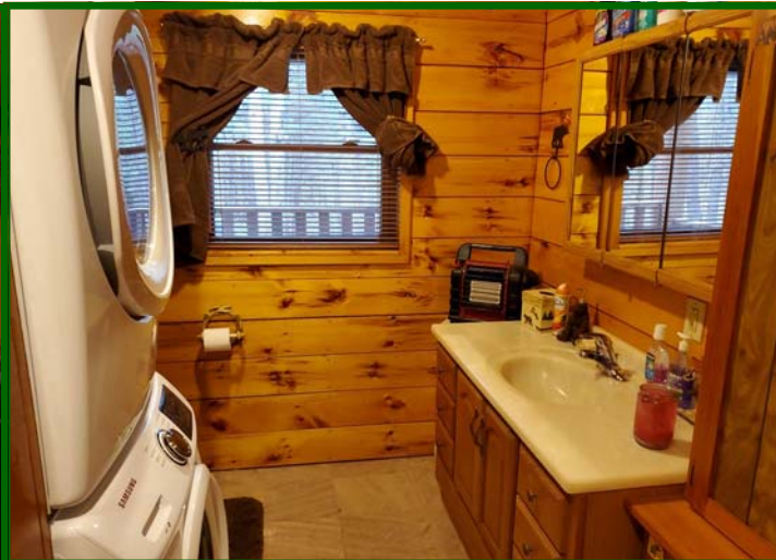
Laundry in First Level Bath

For Additional Information On This Property, Including Video Tour, Tax Map and Disclosures, Log Onto: