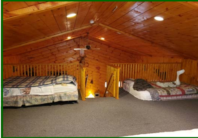
Opposite Bedroom View Overlooking Family Area