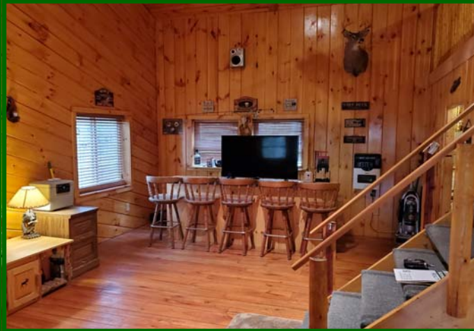
Most Contents Included – Direct TV Access